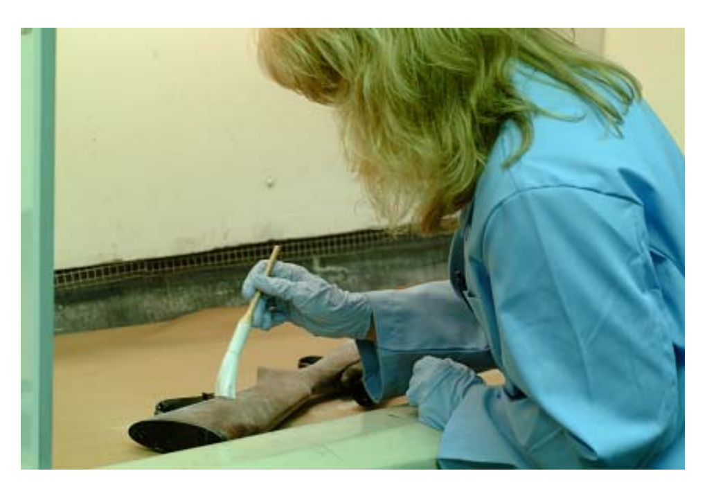
Dusting for Latent Prints

The examiners of the Latent Print Section of the West Virginia State Police Forensic Laboratory receive thousands of pieces of evidence a year, collected from crime scenes by police investigators for the various law enforcement agencies throughout the state. The evidence is put through a variety of physical, chemical and electronic processes designed to reveal the presence of latent impressions. Some of the processes are old and familiar such as powdering – known to fans of crime dramas as "dusting for prints." Others of more recent vintage are perhaps less familiar such as super glue fuming, ninhydrin, fluorescent dye stains, and forensic light sources. Latent prints are revealed when the chosen process adheres, stains, or reacts to constituent properties contained in the residue that makes up the impression. Choice of development technique or sequence of techniques is made by the latent print examiner or one trained in latent print processing. Factors involved in the processor's decision will include the type of surface of which the item is made (absorbent or nonabsorbent, smooth or textured) and the condition of the item at the time it is being processed. Preservation of any developed latent prints is usually determined by the choice of development method and surface type with photography and "lifting" being the essential methods of saving a latent print.