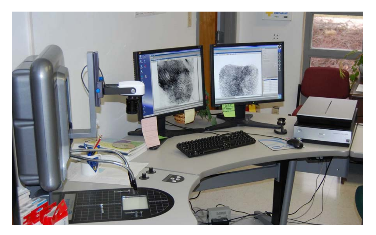
The Automated Fingerprint Identification System (AFIS) – Latent Work Station

Many technological advances have been made in the latent print discipline during the past 100 years, but none more important than AFIS, or Automated Fingerprint Identification System. AFIS, is a computer system that is capable of rapidly searching fingerprint images through a