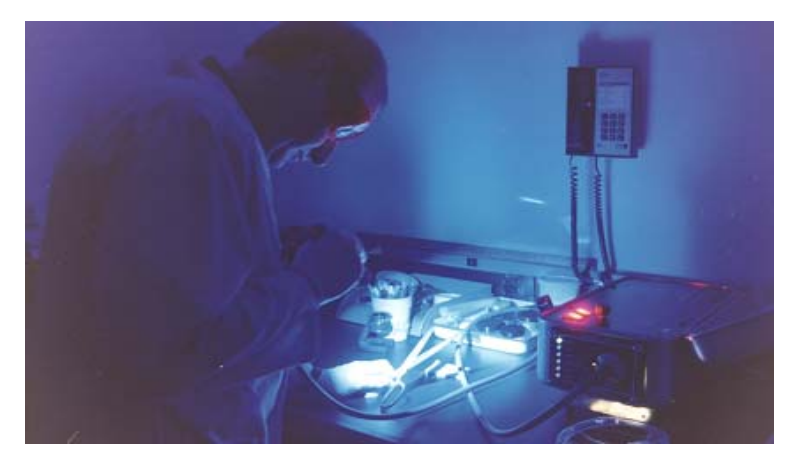
Forensic Light Source

The examiners of the Latent Print Section of the West Virginia State Police Forensic Laboratory receive thousands of pieces of evidence a year, collected from crime scenes by police investigators for the various law enforcement agencies throughout the state. The evidence is put through a variety of physical, chemical and electronic processes designed to reveal the presence of latent impressions. Some of the processes are old and familiar such as powdering – known to fans of crime dramas as "dusting for prints." Others of more recent vintage are perhaps less familiar such as super glue fuming, ninhydrin, fluorescent dye stains, and forensic light sources. Latent prints are revealed when the chosen process adheres, stains, or reacts to constituent properties contained in the residue that makes up the impression. Choice of development technique or sequence of techniques is made by the latent print examiner or one trained in latent print processing. Factors involved in the processor's decision will include the type of surface of which the item is made (absorbent or nonabsorbent, smooth or textured) and the condition of the item at the time it is being processed. Preservation of any developed latent prints is usually determined by the choice of development method and surface type with photography and "lifting" being the essential methods of saving a latent print.