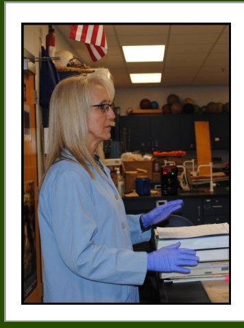
Note: The training provided will be free to the attendees!