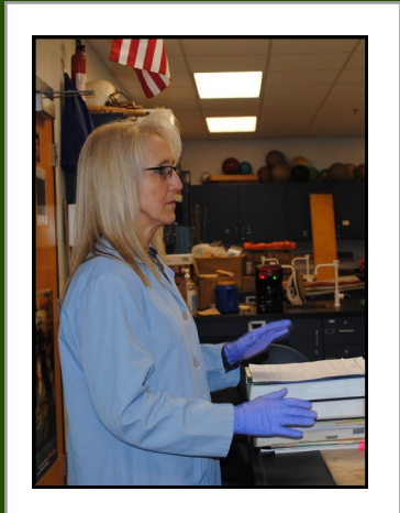
Note: The training provided will be free to the attendees!